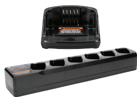
Single and Multi- Unit Chargers