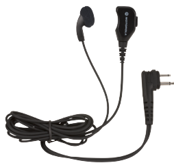
Earbud with In-line Microphone and PTT