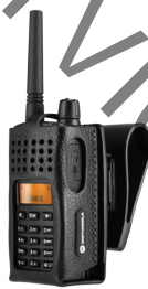
Leather Carry Case