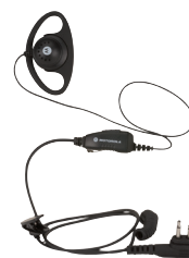
D-Style Earpiece with In-line Microphone and PTT

XT600d Series radios are compatible with XT400 Series accessories except the carry holster and leather case.