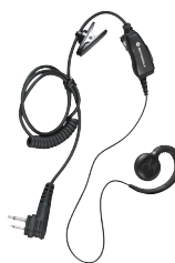
Swivel Earpiece with In-line Microphone and PTT