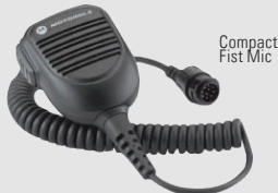
Compact Fist Mic