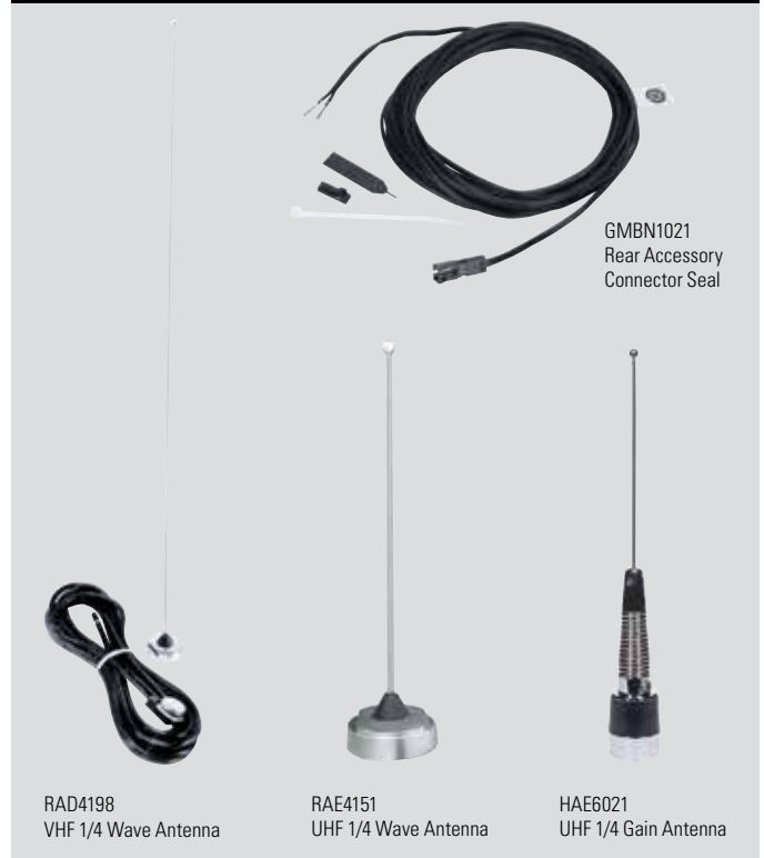
RAD4198 VHF 1/4 Wave Antenna