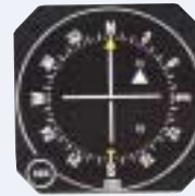
The KI 203 and KI 204 (shown) feature a rectilinear meter movement with a built-in VOR/LOC converter, with the KI 204 incorporating a glideslope needle. (For use with the KX 155A).