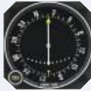
The KI 208 (shown) and KI 209 feature pivoted meter movements, with the KI 209 incorporating a glideslope needle

TSO'd NAV Indicators suitable for use with the KX 155A and KX 165A include: