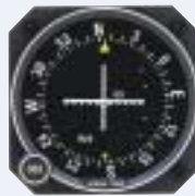
The KI 208A and KI 209A (shown) are similar to the KI 208 and KI 209 but add an interface to the KLN 89/89B and KLN 94 GPS receivers.