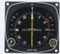
The KI 525A Horizontal Situation Indicator is part of the KCS 55A Compass System. It combines heading and VOR/LOC/GS information in a single presentation (requires a KN 72 VOR/LOC converter when interfaced to the KX 155A).

The KI 206, used with the KX165A, is similar in appearance to the KI 204 but requires input from an external VOR/LOC converter.